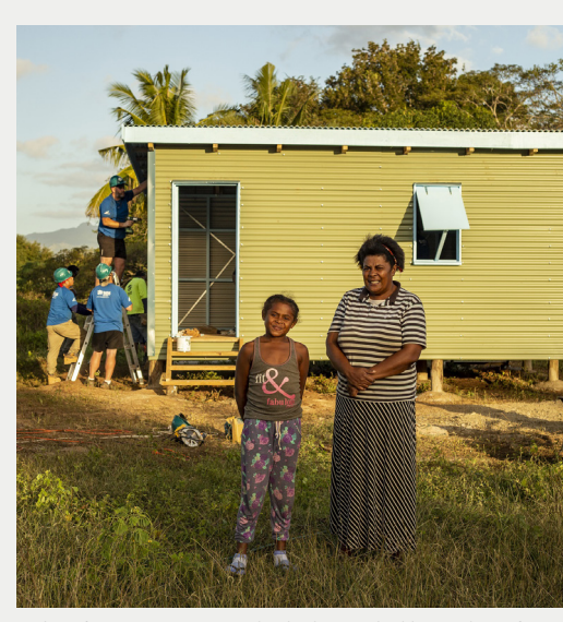
Habitat for Humanity New Zealand volunteers build a new home for a family in Dratubu Village, Fiji

Financial support for CID member aid charities increased despite Covid, although total income continues to trend downwards from a high of $215 million in 2016-17.