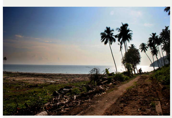
Indonesia, Tsunami

We are delighted CID has gained a number of new members, and it is wonderful to see their enthusiasm in engaging with the Code. During the last year, the review recommendations have started to be implemented as the Code continues to mature and respond to our changing landscape.