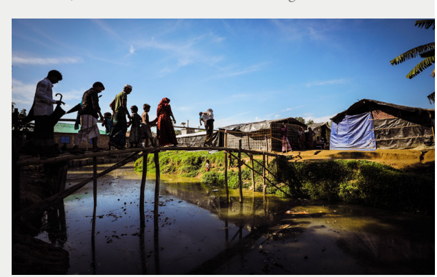
Rohingya crisis, Cox's Bazar

A copy of the audited financial statements are available on the CID website.