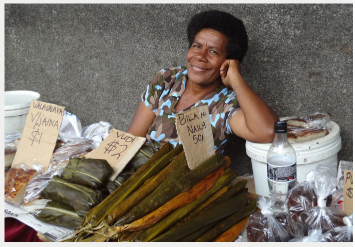
Fiii

The membership has increased to bring in more charities, but also Crown Research Institutes, social enterprises, universities and businesses active in development.