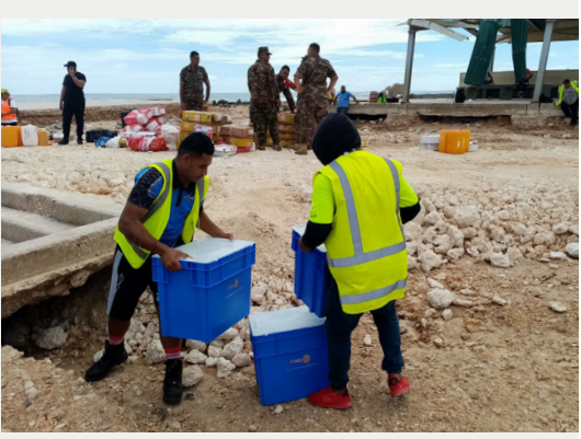
Responding to Cyclone Harold, Eua Island, Tonga