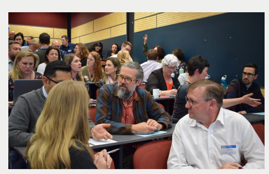
CID members attend the Annual CID Conference

At CID, we have continued to adapt along with our members. More people than ever, from New Zealand and across the Pacific region took part in CID's online training sessions. We've hosted some of our biggest events, with more than 300 people and politicians from every parliamentary party turning up to debate aid and trade. And over 600 people from 30 countries taking part in the online joint annual conference (Oceania Connect) with our Australian and Pacific partners.